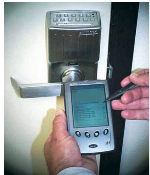
PocketPC® infrared programming of a Stanley OMNIBLOCK Magnetic Card Reader Cylindrical lock (shown above).