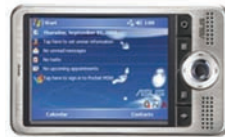
Above is an ASUS A626 MyPal® PocketPC® with Intel PXA-250 processor.

The stainless weatherized shroud (right) p/n OMD-12911 is often used to prevent desert sand or freezing rain from accumulating on the keypads.