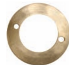
Large spacer 1 3/8" (part number 1676349)